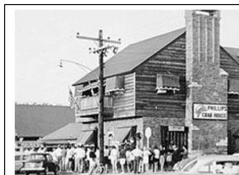
The Phillips family original crabhouse.

The companies receiving the business leadership awards are DARCARS automotive group; Firaxis,