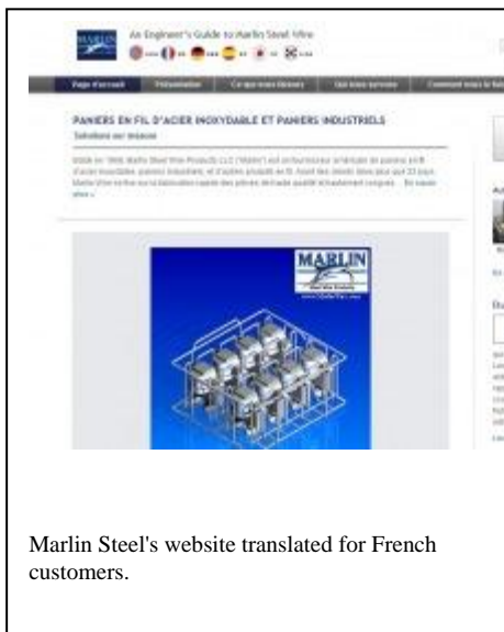
Marlin Steel's website translated for French customers.

Through its main office in Baltimore and 10 offices around the globe, the Department of Business and Economic Development's Office of International Investment and Trade works to stimulate foreign direct investment in Maryland, offers export assistance for small and mid-sized Maryland